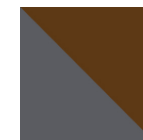
Dark Grey Brown