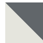
Charcoal Grey Mix