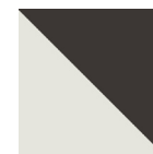
Brown Grey Mix