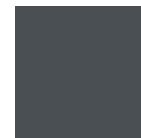
Dark Grey Blue